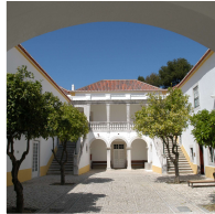
Casa da Cerca