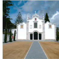
Convento dos Capuchos