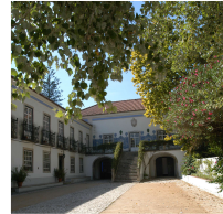
Solar dos Zagalos